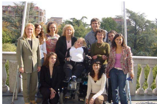
Meeting of the A Private Matter partnership in Modena on October 13 th -14 th

And if you have grandparents or female relatives living nearby, you can't even get your children into the pre-schools. Women are expected to solve the problem themselves. Gender School will be contributing to the project by presenting Swedish social models as well as gender expertise, but also learning from the new perspectives presented by the Italian, French and Spanish partnership.