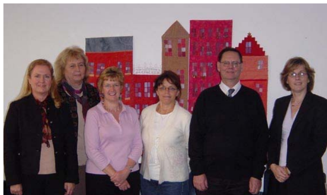
Meeting of the Hackers for Equality partnership in Brussels on Sunday October 30 th

closed for three months in the summer as well as for Christmas and Easter holidays.